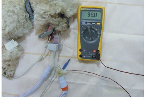
Darvall's Heated Smooth Wall Circuits Revolutionary

39°C. A sensor imbedded at the Y piece monitors gas temperature to control heating. Recent research shows that in animals as small as 3kg, warming inspired air was as effective as Darvall Forced Warm Air heating at preventing heat loss during anesthesia.