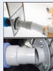
Cage Door Adapter Kit